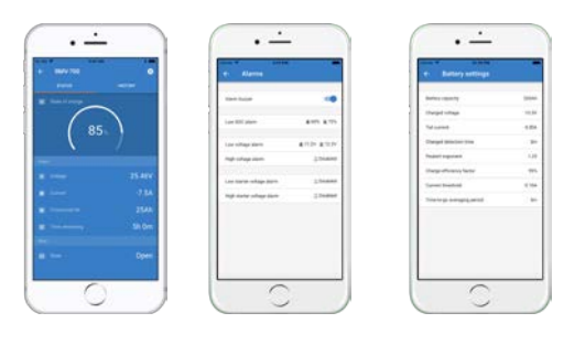
See the VictronConnect BMV app Discovery Sheet for more screenshots